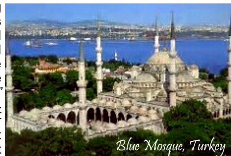
Blue Mosque, Turkey