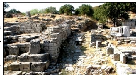
Ancient City of Troy, Turkey