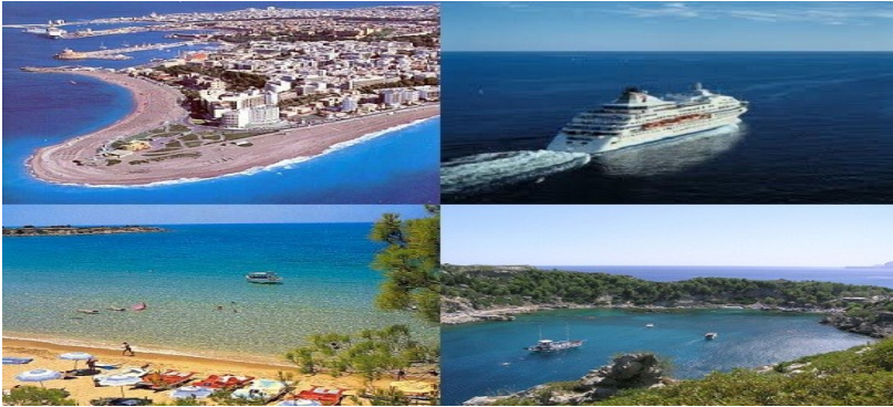
Day 8: The ship enters the port of the Island of Rhodes, Greece