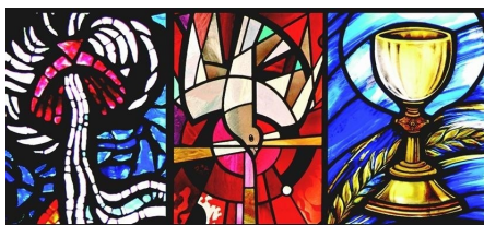
OFFER, STRENGTHEN, SUSTAIN

Receiving Sacraments "Out of Order" Reflections on the Original Order