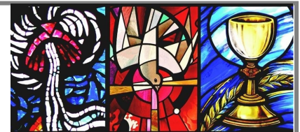
OFFER, STRENGTHEN, SUSTAIN

Soon, seven-year-olds who were baptized as infants will complete their sacraments of initiation in this original order. (When this will happen depends on your parish plan.) Specifically, children will be confirmed prior to receiving First Communion. They will not “transition” into adulthood. They will be fully initiated into our faith.