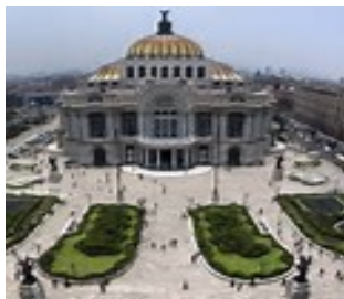
National Palace, Mexico City