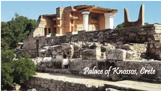
Palace of Knossos, Crete