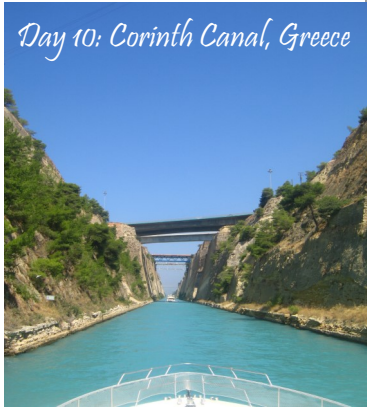
Day 10: Corinth Canal, Greece