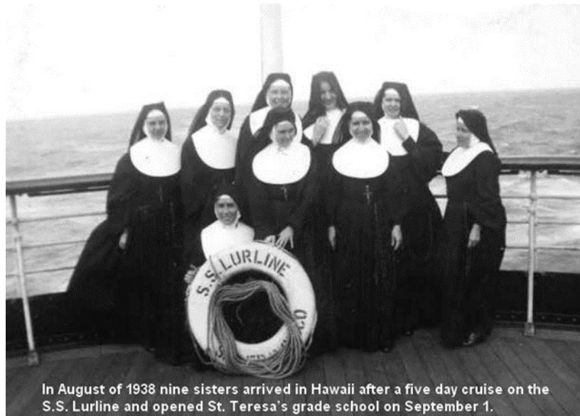
In August of 1938 nine sisters arrived in Hawaii after a five day cruise on the S.S. Lurline and opened St. Teresa's grade school on September 1.