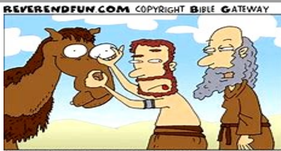
"I'M PRETTY SURE IT GOES 'CAMEL THROUGH THE EYE OF A NEEDLE.' NOT THE OTHER WAY AROUND!"