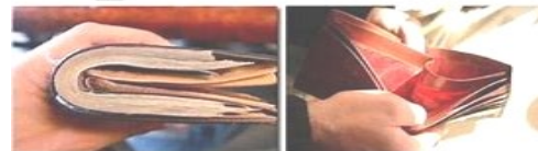
Before Valentine's Day After Valentine's Day