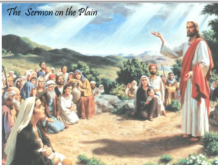
The Sermon on the Plain