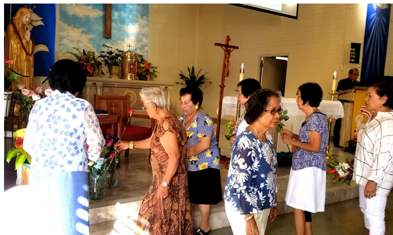
Parishioners offer flowers to the Blessed Lady.