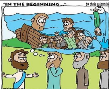
"Do not be afraid, for I will make you fishers of men."