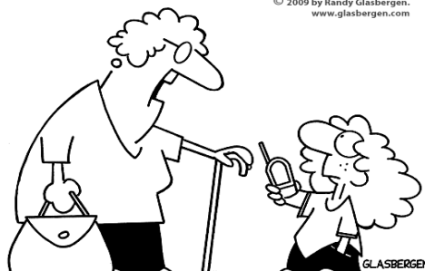
“Wireless communication is nothing new, I’ve been praying for 75 years.”