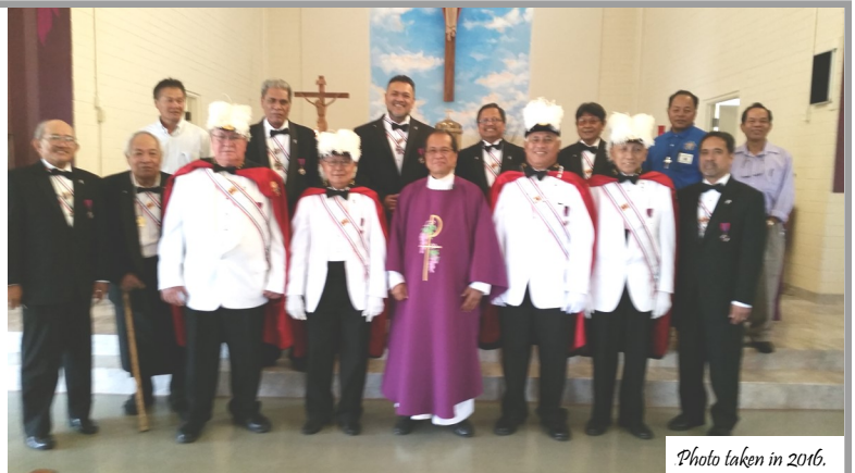
Photo taken in 2016.