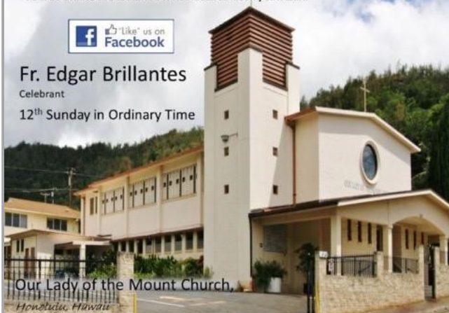
Our Lady of the Mount Church, Honolulu, Hawaii