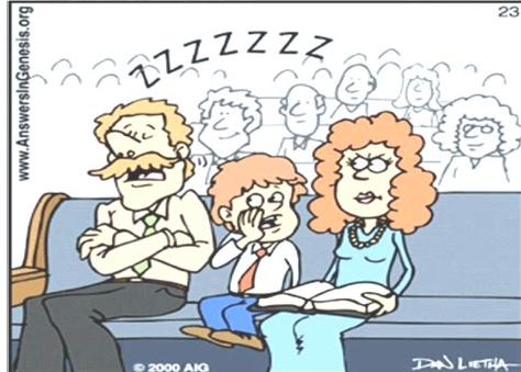
Mom, I think Dad is taking the "day of rest" a little too far.