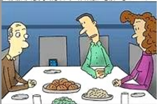
SIRI ... SAY GRACE