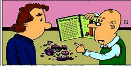
AS YOU CAN CLEARLY SEE BY THIS LEDGER, YOU HAVE BEEN FORGIVEN 490 TIMES AND ARE NO LONGER COVERED BY THE BIBLICAL POLICY

A problem with literal interpretation! (Cartoon by ReverendFun.Com)