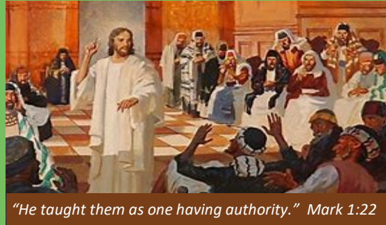
"He taught them as one having authority." Mark 1:22