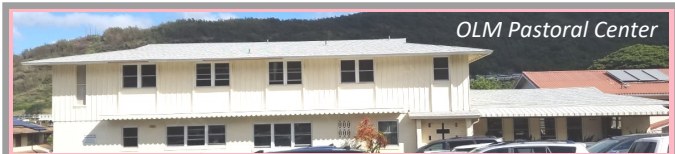
OLM Pastoral Center

(Lifted from International Catholic Stewardship Council e-bulletin , July 2021)