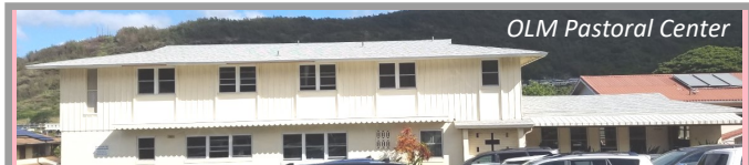
OLM Pastoral Center

(Lifted from International Catholic Stewardship Council e-bulletin, July 2021)