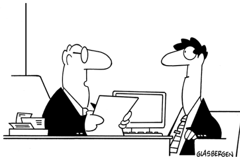
"It says on your résumé that you were created in God's image. Very impressive."