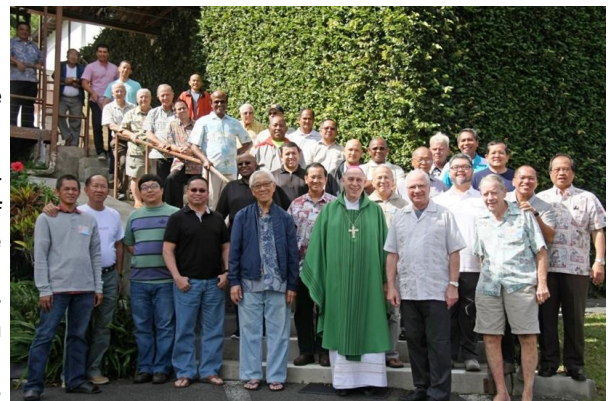
From OLM Archive 2015