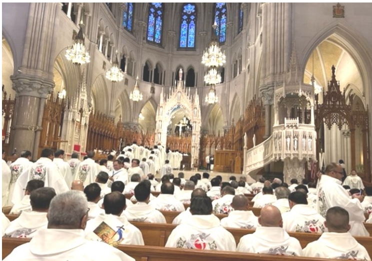
Photo at left: Concelebrated Mass at the Sacred Heart Cathedral-Basilica in Newark, New Jersey.