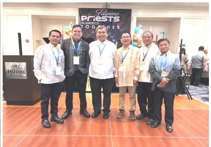
2 Photos above: Gala Dinner on the last night of the Assembly participated by lay people of New Jersey and New York who were sponsors of the accommodation and receptions. The priests were required to wear Barong Tagalog.