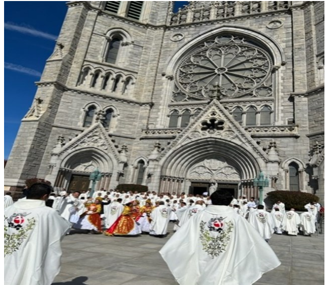
Photo at right: Gathering for the processional entrance in front of the Sacred Heart Cathedral-Basilica in Newark, NJ