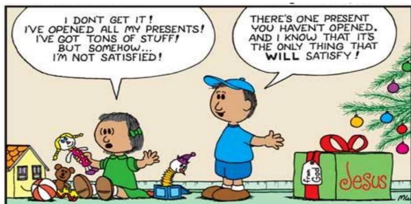
Let them give thanks to the LORD for his unending love and his wonderful deeds for men, for he satisfies the thirsty and fills the hungry with good things.

"Eternal rest grant unto them, O Lord, and let the perpetual light shine upon them." We extend our heartfelt prayers and sympathy to the grieving families.