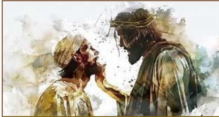
Jesus heals blind Bartimaeus. Mark 10:46-52