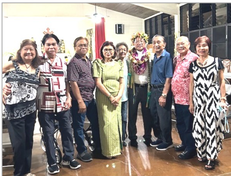
With parish leaders, ministers, volunteers and friends.