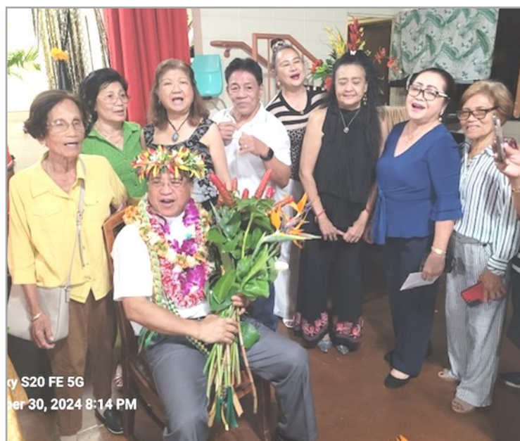
The ladies rendering their birthday song number.