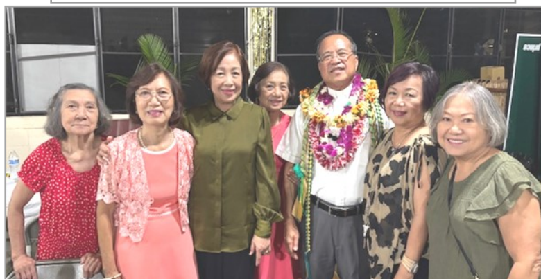
Well-wishers, parishioners, food-donors, friends – all in the family.