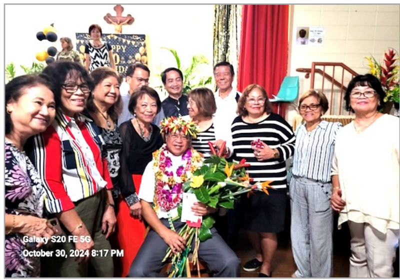
Flower offering and crowning the king of the day.