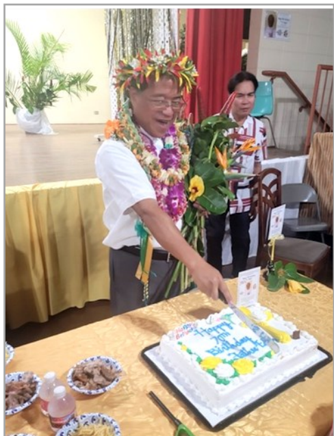
Cutting the cake.