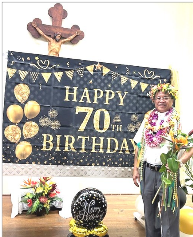
There's no hiding – the birthday boy is 70 and is not getting older, just growing better and wiser!.