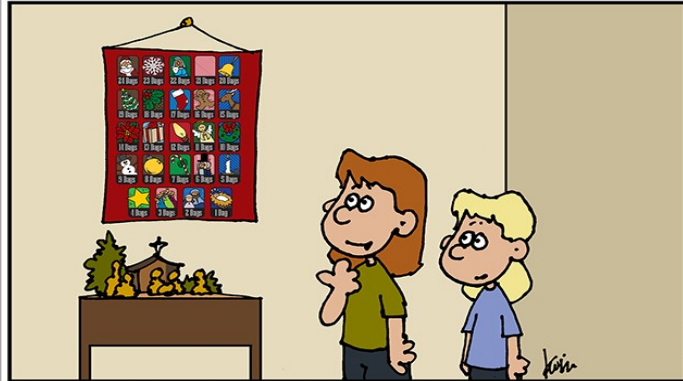
"That's called an advent calendar — it tells you just how many more days you have to be good!"