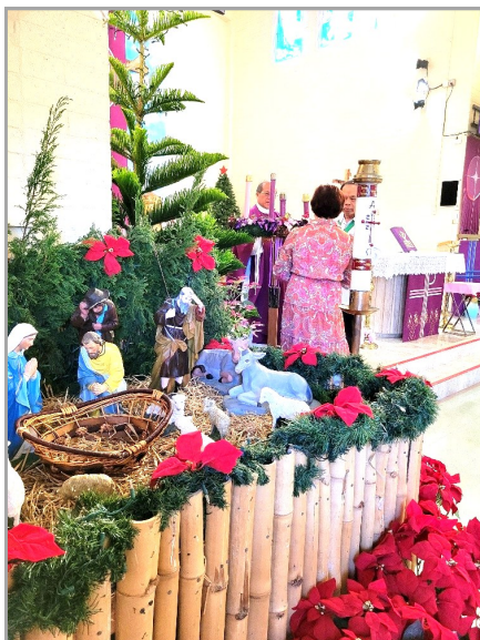
Marivic & Silver Palting