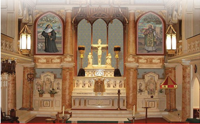
Diocese of Honolulu • Roman Catholic Church in the State of Hawaii • www.catholichawaii.org