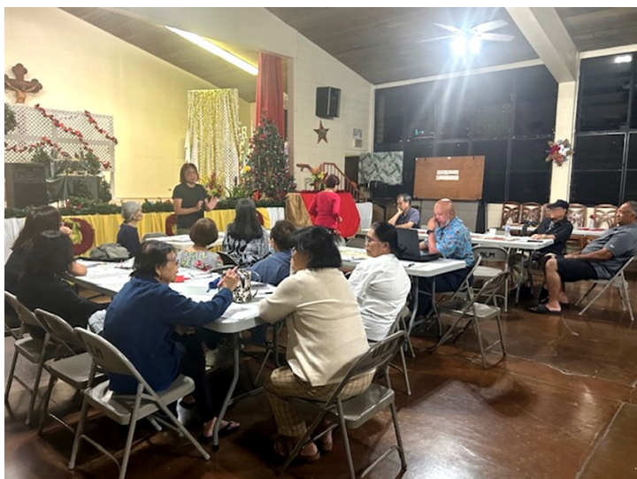
< Left photo: Preliminary meeting of leaders for the parish anniversary celebration.