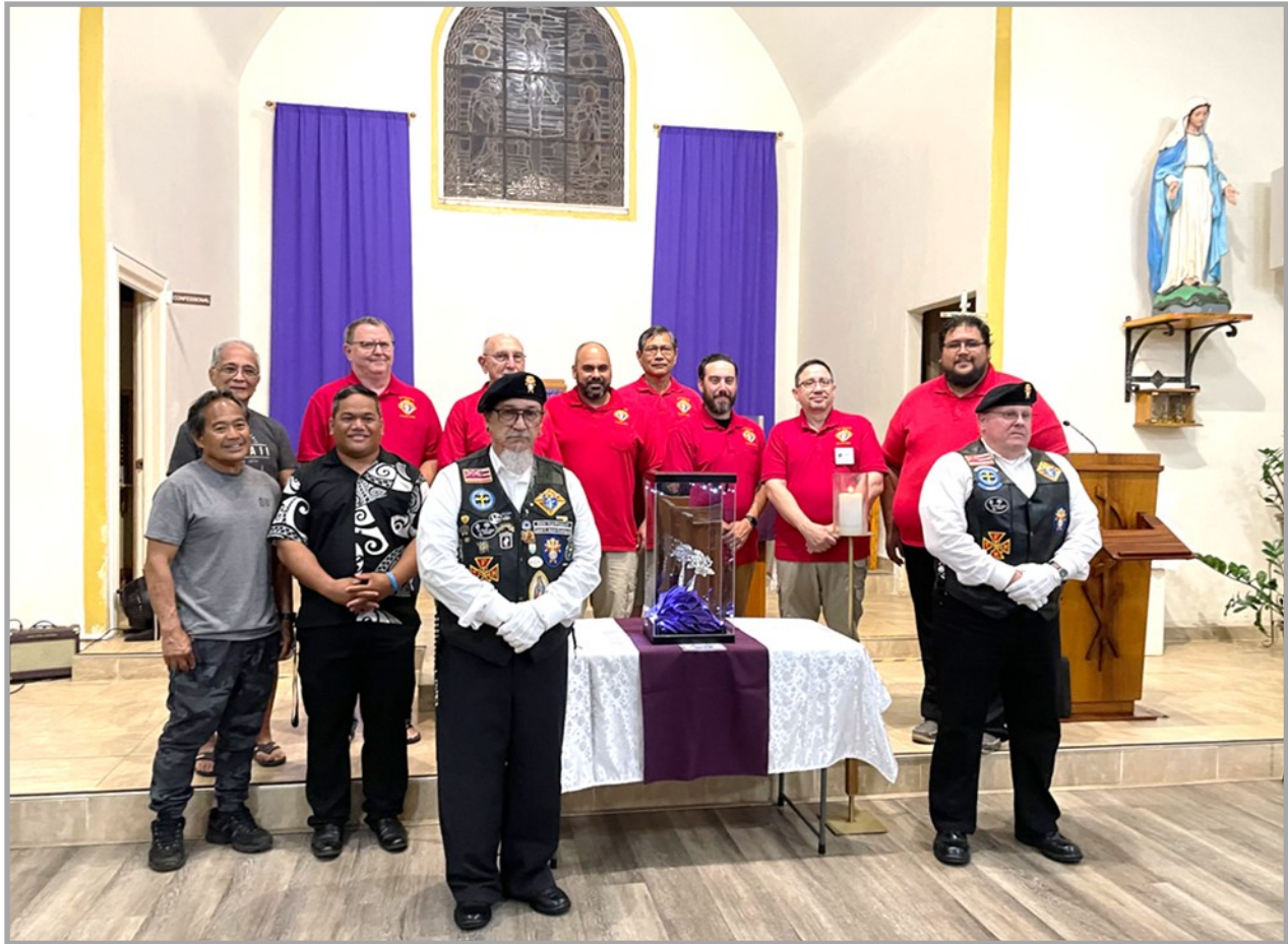
(Above photo): The Knights of Columbus team bringing the Silver Rose of Our Lady of Guadalupe from church to church.