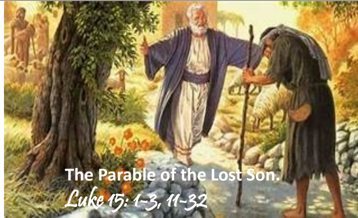
The Parable of the Lost Son. Luke 15: 1-3, 11-32