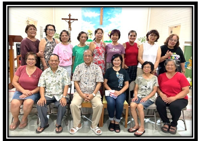
The Saturday church cleaners and decorators.