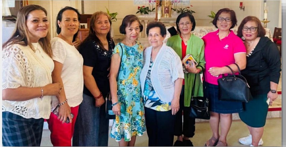
Happy Birthday Celebrations!